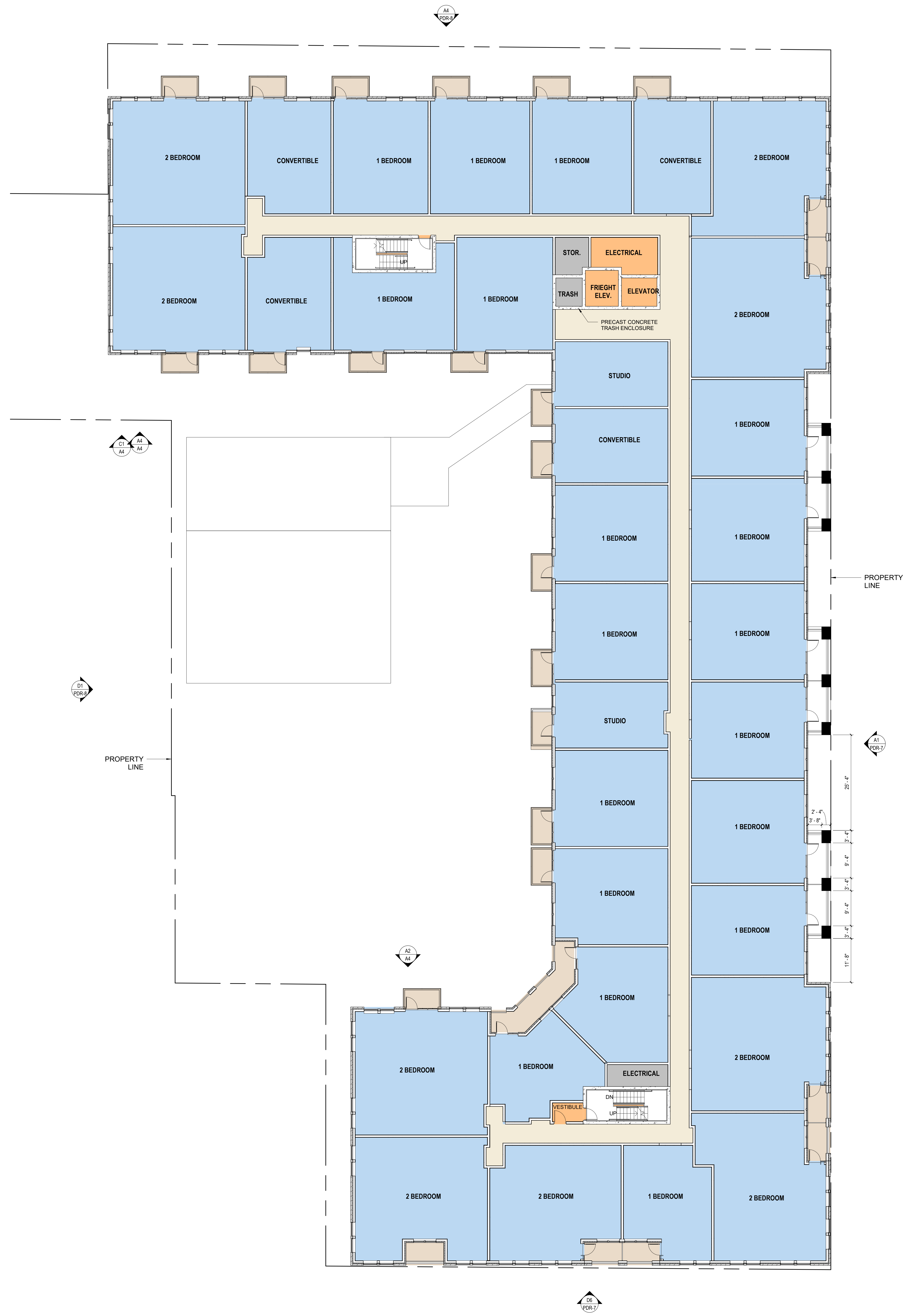
1 FOURTH FLOOR PLAN 3/32" = 1'-0"